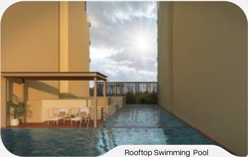
Rooftop Swimming Pool