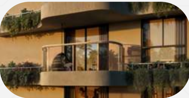
All Images are Architectural Representation