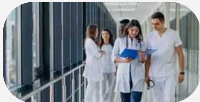
All Images are Representational Purpose only